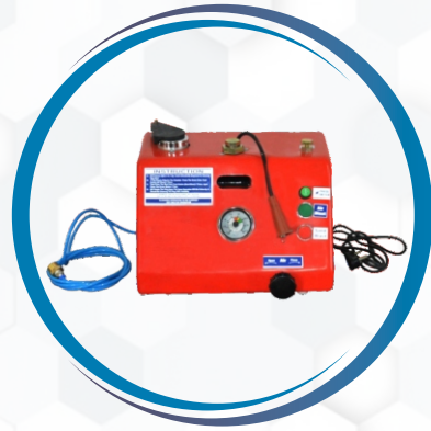
SPARK PLUG CLEANER CUM TESTER