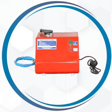
SPARK PLUG CLEANER