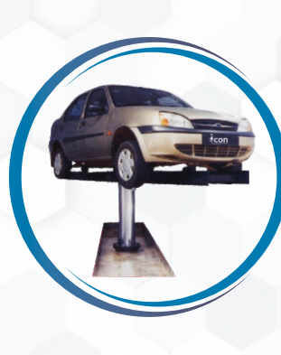
HYDRAULIC WASHING LIFT TYRE REST PLATFORM