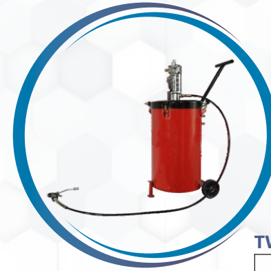
TWO POST LIFT-HYDRAULIC