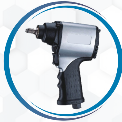
3/8"-AIR IMPACT WRENCH