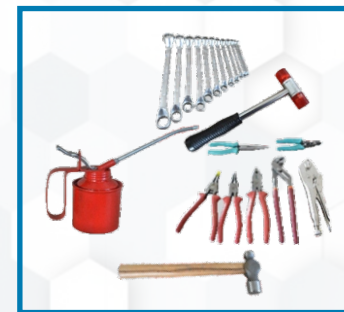
HAND TOOLS TAPARIA